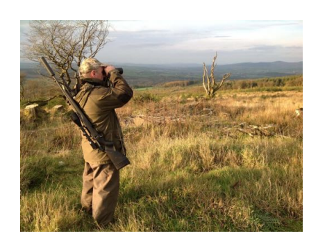
Deer cull strategy and timetable