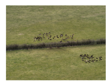
Deer management strategy