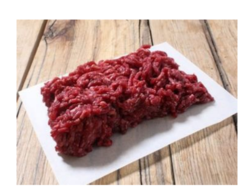
Mince sold to The Country Food Trust