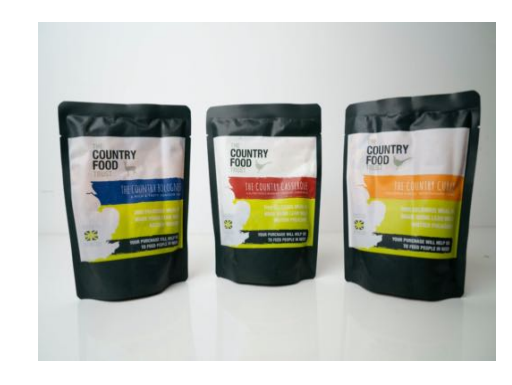
The Country Food Trust Manufacture ambient pouches