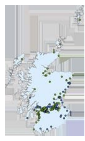
Pouches distributed around the country feeding people in need